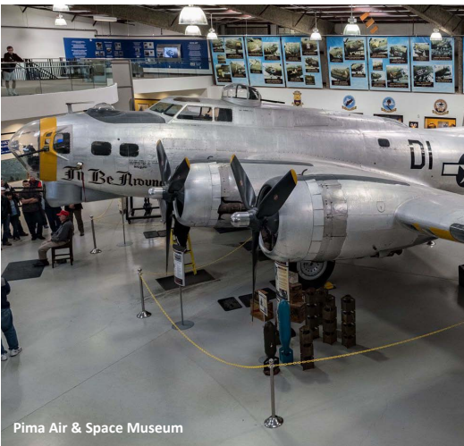
Pima Air & Space Museum